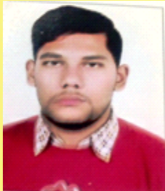
GAURAV BADHAN EDU. CULTURE PVT.LTD.