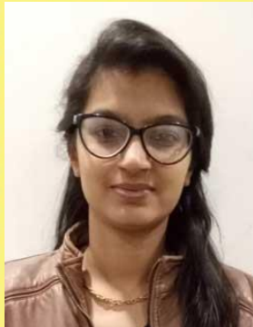
MRINAAL IMPINGE SOLUTIONS