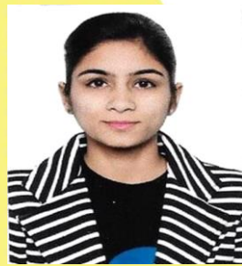
PRIYANKA BHUTANI EDU. CULTURE PVT.LTD.