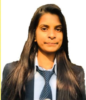
SWEKSHA SHUKLA EDU. CULTURE PVT.LTD.