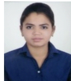
POOJA RANI EDU. CULTURE PVT.LTD.